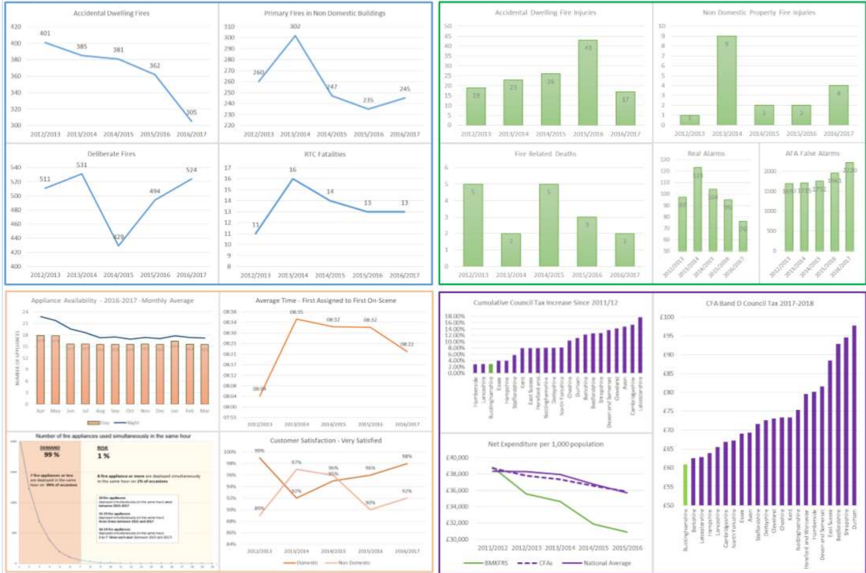
Figures as at 05/07/2017— does not include outstanding IRS reports (2015/2016: 303 - 2016/2017: 204) - most of which are with RBFRS